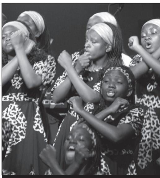
Over 500 guests and raised over $1700 at the Matsiko Choir concert on November 7th

The concert Friday night packed in over 500 guests and raised over $1700. It was a wonderful evening where the beauty of the Kingdom of God was truly reflected. At the end of the performance, one of the representatives from the International Children's Network, who organized the choir, talked about the need for sponsorships for kids like these who are at-risk and in tremendous need of help. Between the concert Friday evening and Sunday at Foothill Church, Foothill families sponsored 38 children at $30/month! This means $13,680 was pledged to help children around the world! Not a bad way to spend a weekend.