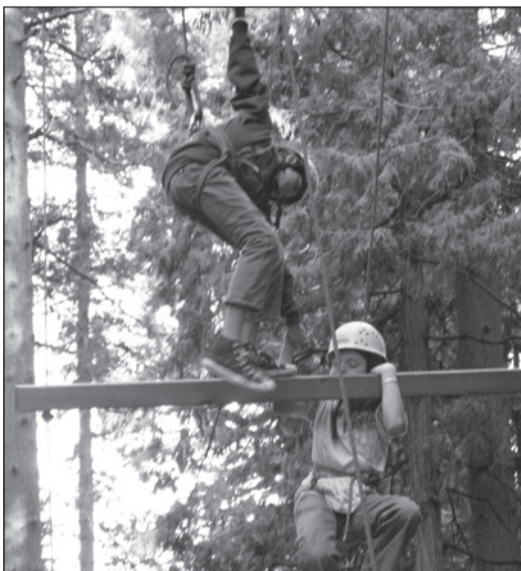
Mountain-top Experience Shapes Their Future

Students came home from this camp transformed and thirsty for more contact and experience with the LORD. In their conversations and attitudes, it is evident that they are striving to learn how their mountain-top experience can apply and be just as evident in their life in the 'real world' back home.