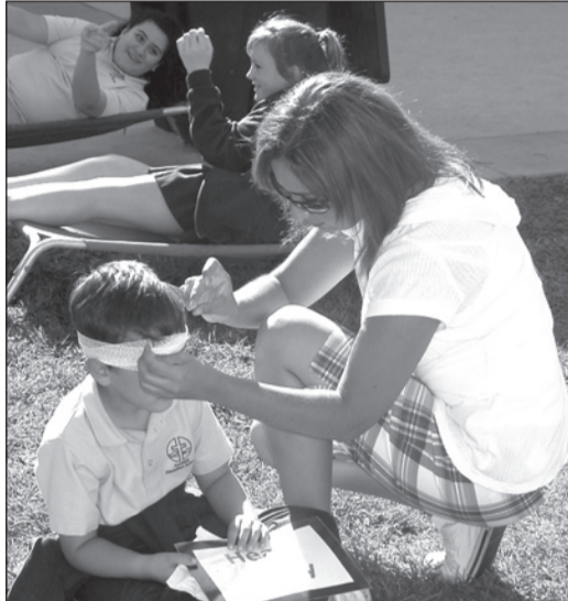
A staff member designated as emergency personnel attends to an "injured" student

and the students were incredible. In the end, designated emergency personnel were able to assess the evacuation plan, identify what worked well and what needed improvement. All in all, it was a very informative day.